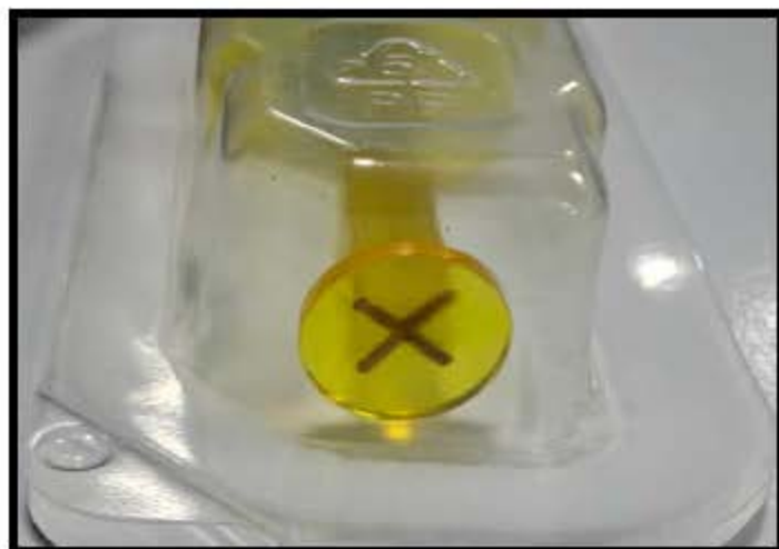
Figure 2: Good Blister Product