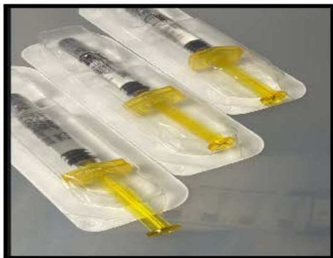
Figure 1: Damaged Blister Product